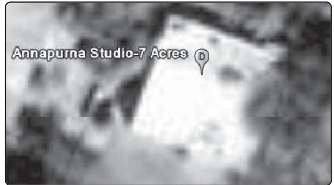
Google photo showing Annapurna Studios-7Acres

Green Cover: Annapurna Studios have replied that they are “only augmenting existing facilities” and going for ISO-9001 & 14001 certification, and they have “intentions of maintaining the greenery undisturbed.” FBH have written to them on 7 th April, 2009 to confirm that existing trees will not be cut at all.