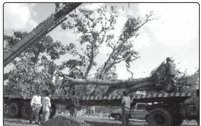
A tree is being transported to translocation site

Times of India's efforts has brought awareness widely about the aspect. This translocation have been encouraged by the Chief Secretary of A.P., from the word go.