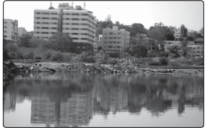
The lake adjoining the Hotel Taj Banjara

were told that a Sewage Treatment Plant will be set up in the nearby grave yard and a dam will be constructed nearby to store treated water before being released to the lake.