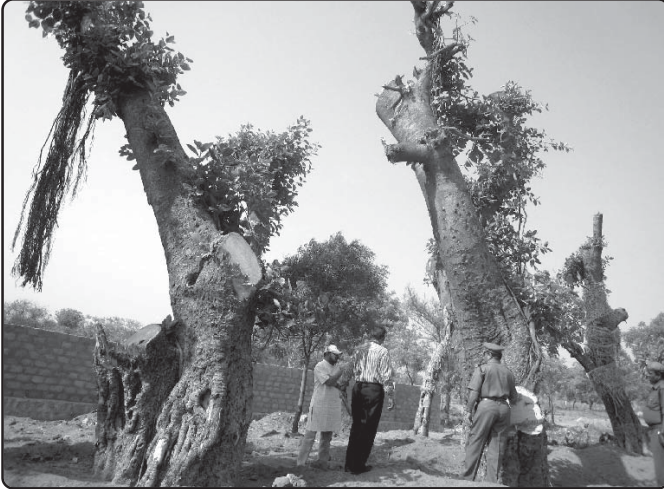
Translocated trees showing growth

Hussainsagar Lake : On 7 th April, 2009 FBH have sought from HMDA a copy of the report of the Supreme Court appointed 3 Member Monitoring Committee (Under RTI Act).