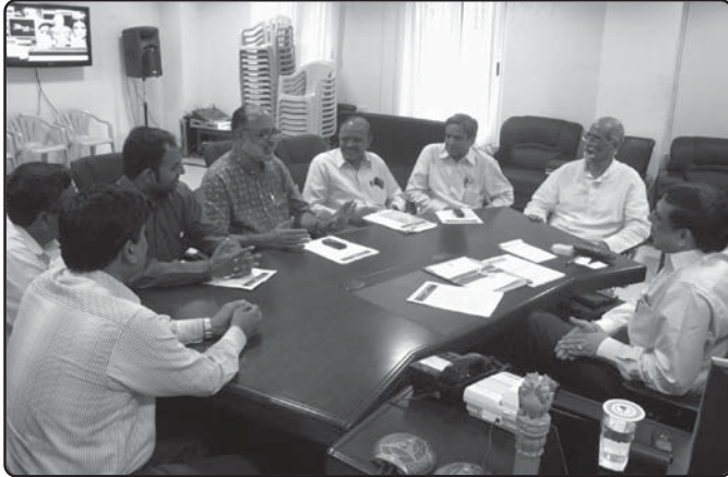
The State Convenors of Ennikala Nigha Vedika, A.P., at one of the meeting with the CEO, A.P.,

The Hindu had published on 17 th Feb. 2009, the gist of a recently published book stating that Patancheru industrial area's common effluent treatment plant's discharge is creating another