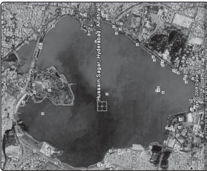
Google photoshowing Hussain sagar lake

Hussainsagar Lake : On 7 th April, 2009 FBH have sought from HMDA a copy of the report of the Supreme Court appointed 3 Member Monitoring Committee (Under RTI Act).