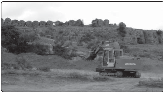
A heavy machine working in side the Nayaquilla

“Bhopal-in-the making” in Hyderabad. FBH have taken up with AP Pollution Control Board to ascertain what steps have been taken to prevent possible ecological disaster.