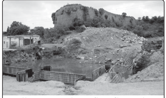
Heavy construction between Shatam Cheruvu and the Moat of the Golconda Fort