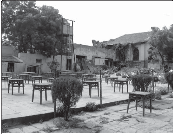
Court Yard view of Monty's Hotel, a heritage building.

f. Following the visit of DG,ASI and his team, Forum submitted a further letter to the DG,ASI, that as so far no MOU has been