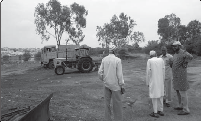
A part of Shatam Cheruvu was provided to Golf Course for the office