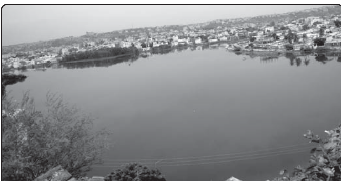
An over view of Shatam Cheruvu, the encroachment can be seen around it in the shape of extended colonies

Of late, we find attempts to dig tunnels through the Moat Wall / Fort Wall, even to dig the Moat beds by blasting.. Proposals for these were rejected by the ASI. ASI's instructions to stop the works were not heeded. Constructions were commenced by GHMC even on the moat bed adjacent to Shatam Talab